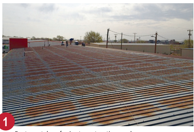
Rusty metal roof prior to restoration work.