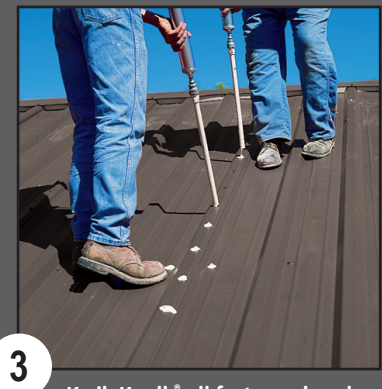
wik Kaulk<sup>®</sup> all fastener heads.