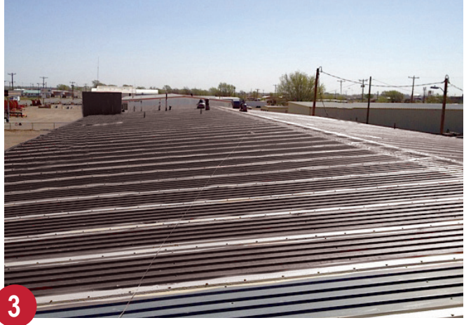
Metal roof after application of Spunflex<sup>®</sup> fabric and Rapid Roof<sup>®</sup> base coat to the seams along with Kwik Kaulk<sup>®</sup> sealent application to the fasteners.