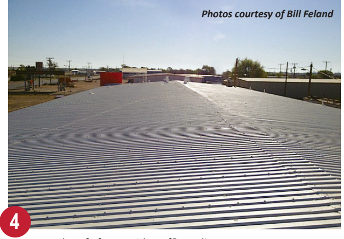
Metal roof after Rapid Roof® acrylic top-coat.

"Our family has been installing the MR System in the Central Valley of California since the 1980s. Some of our customers have experienced the benefits of this system for over 30 years. We find the MR System is a great way for our clients to preserve and restore their metal buildings. Often, it eliminates the need for labor-intensive and costly tear-off and disposal. Our clients have peace of mind knowing that whichever Conklin cool roof coating they choose to use with the MR System, it will help to reduce their utility costs and extend the life of their investment. The diverse products and warranties offered by Conklin Roofing Systems also help our customers decide which coating system works best for their budgets and goals. Additionally, the warranties offered are non-prorated and renewable."