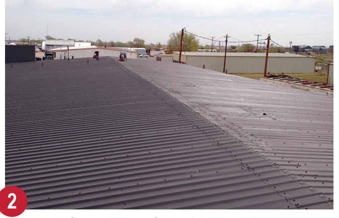
Metal after application of rust-inhibiting, Conklin Encase<sup>®</sup> Metal Primer.